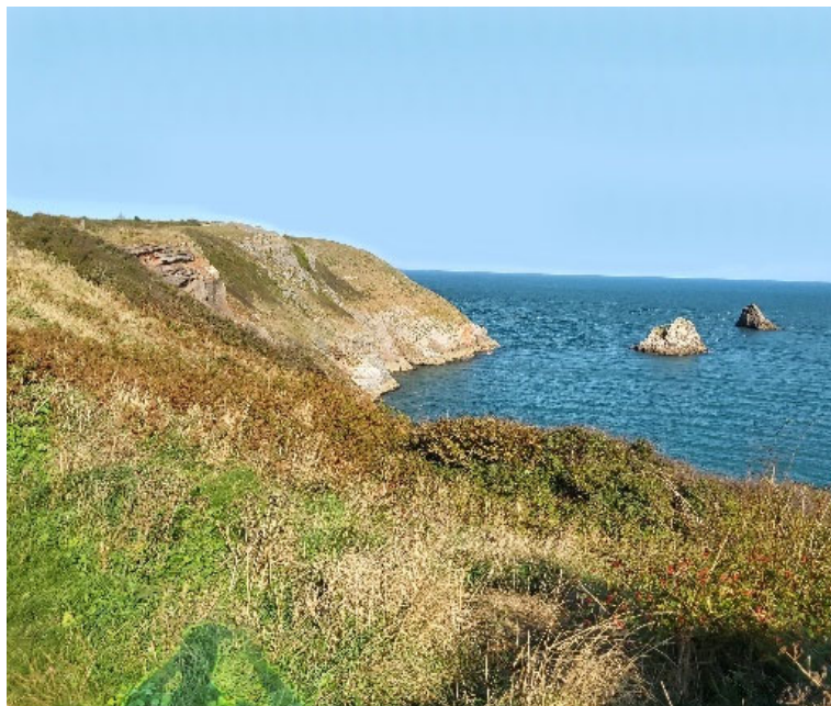
Access Coast Path Views