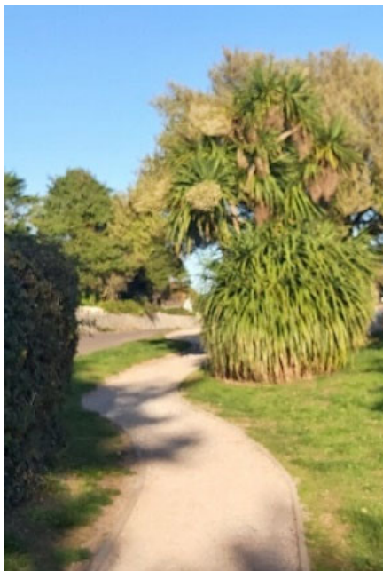
Access the Countryside